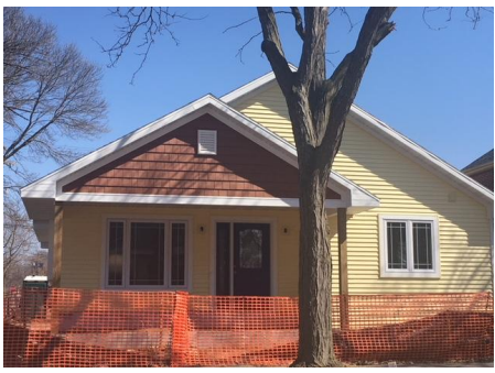
Single Family Home, 1203 6th Street

As the skies clear and the warmth of the sun gets stronger, builders are working hard to complete new Promise spec homes which are now for sale or will be soon.