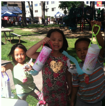
Making La Crosse Promise windsocks at the Cameron Park Farmer's Market

Cameron Park Farmer's Market: June 23, August 19 and September 15 (4 - 6 p.m.)