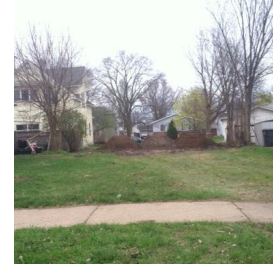
Potential Promise lot purchased by a builder and cleared on Hood Street between 9th and 10th.

Demolition is scheduled this month for the next spec home at 504 Johnson, which will be for sale.