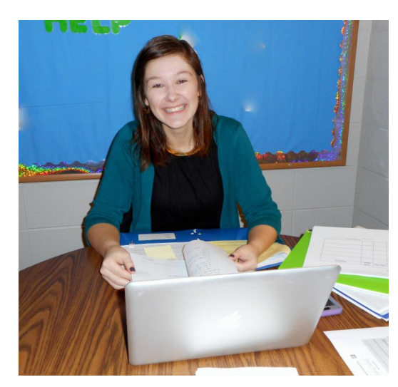
Intern Wanted! We are currently looking for an intern for